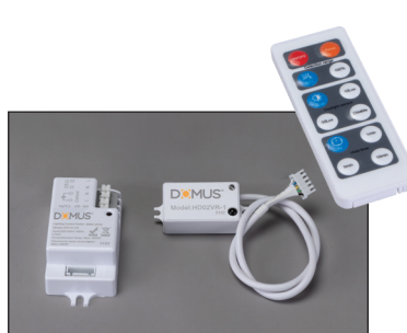
Internal ON/Off Sensor